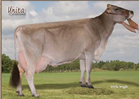
SWISS DREAM DENMARK UNITA EX-91 2E 3 Generations EX; 2 EX & 1 VG Daughter Reserve All-Canadian 4 Yr Old 2004 3 female sexed embryos sell by Wonderment!