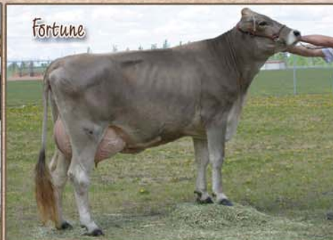
BROOKVIEW DENN FORTUNE VG-88 2YR HM All-Canadian 2yr Old 2002 1 EX-92 Daughter Choice of heifer calf by Vigor born Dec '09 Sells!