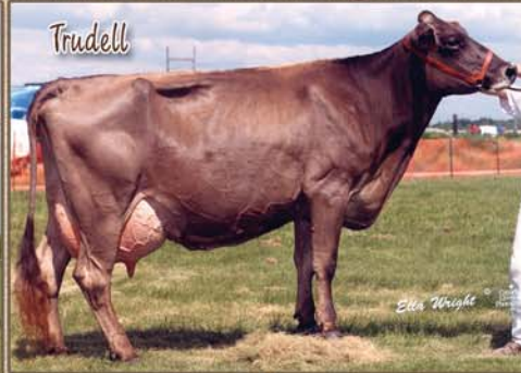
CRIKSIDE TRUDELL EX-92 Fastbreak grand daughter sells!