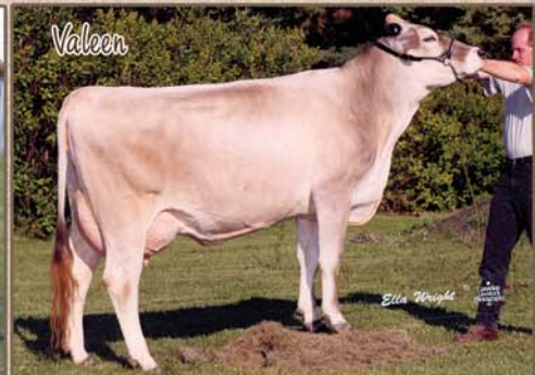
POPULAR OAK VALEEN EX-91 2 Great Grand Daughters by Fastbreak sell! Four Oak Farms