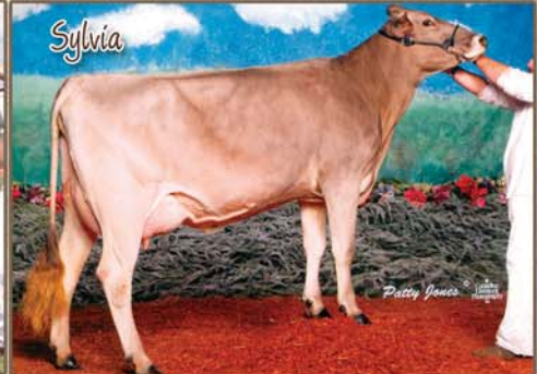
SWISS DREAM JETVIN SYLVIA EX-92 All-Canadian Senior Yearling 2004 Sept '09 Wonderment heifer sells!