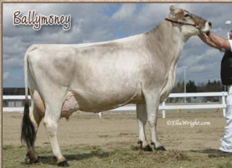
DRUMHAGGART JASPER BALLYMONEY 1st 3 Yr Old & HM Grand Champion 2002 Morris Stampede Her 2yr Old Mission Daughter Sells!