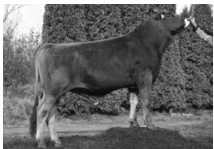
Swissgenetics bulls available in Canada:

Uranus started the Young Sire Proving Program this fall and we hope you can appreciate his pedigree & genetic potential. But here are two new good reasons to use him: 1) The new SMA test from Germany, which is 100% accurate, confirmed that URANUS is SMA free! 2) Uranus wasn't pictured when the pedigree was printed. Here it is: